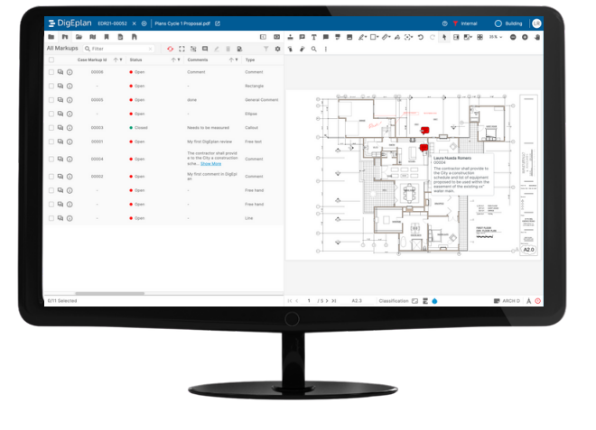
DigEplan's rich set of annotations allows easy communication across multiple departments

USA: +1 602-714-9774 Email: sales@avolvesoftware.com www.avolvesoftware.com