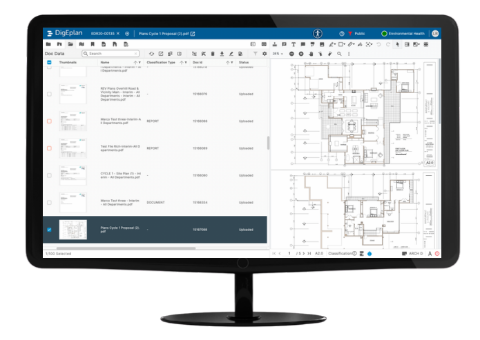
DigEplan uses the standard portal, workflows, document management and tasking of Cityworks PLL

With DigEplan for Cityworks PLL electronic plan review, users can simultaneously review, adding their digital correction comments and instructions at the same time. This serves to standardize, streamline and accelerate workflows for the electronic planning process.