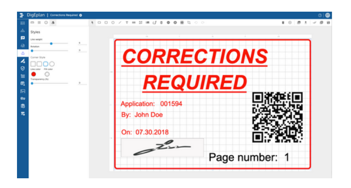
DigEplan Intellistamps uses meta-data that supports electronic stamping and sign-off

Reviewers can apply Intellistamps to electronically sign and stamp document sets with attributes from Amanda. Intelligent stamps retrieve and insert information from Amanda, enabling quick approvals and digital sign-off. The sign-off stamp contains information about the annotation author, Case Id, date and time of creation, providing a reliable audit trail of changes and approvals.