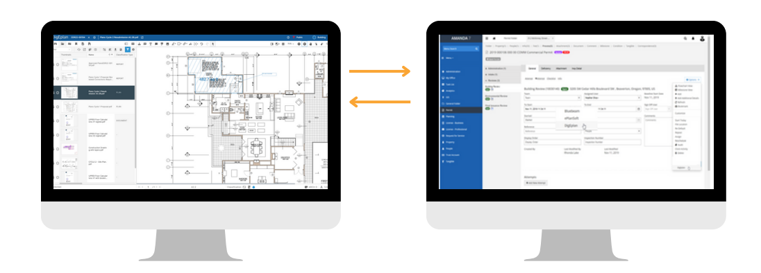
DigEplan is fully integrated to Amanda so all interactions with the plans are recorded and available in Amanda.

Cities, counties and other public sector organizations can further exploit their investment in Amanda when adding DigEplan. DigEplan enables Amanda users to efficiently work with electronic plans that need to be viewed, commented upon, stamped, and rejected or approved. Amanda users can instantly access plans and other supporting documents for analysis, viewing, annotation, stamping, printing, and archiving, removing the need for paper or cumbersome desktop PDF tools.