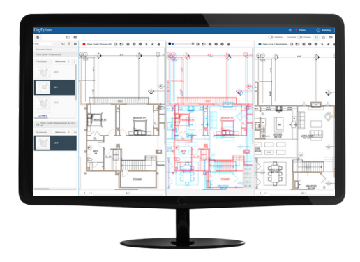
Quickly and easily spot hard to see differences in subsequent review cycle

The compare capability allows users to instantly determine what has been added, removed, or changed in documents. This is particularly useful during the review of resubmitted plans or documents. Hard to spot differences between the original file and subsequent resubmittals can be easily identified, saving time and quickly catching accidental or intentional changes beyond what was requested.