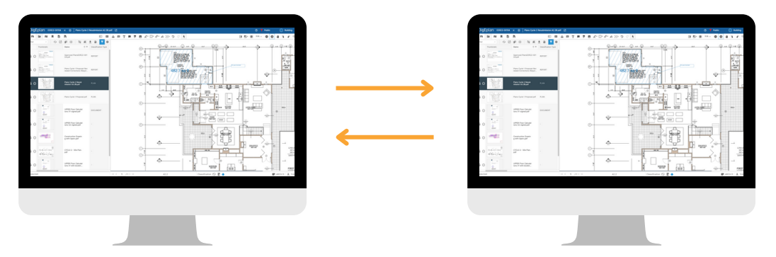
DigEplan is fully integrated to Accela so all interactions with the plans are recorded and available in Accela

Accela users can instantly access plans and other supporting documents for analysis, viewing, annotation, stamping, printing, and archiving, removing the need for paper or cumbersome desktop PDF tools.