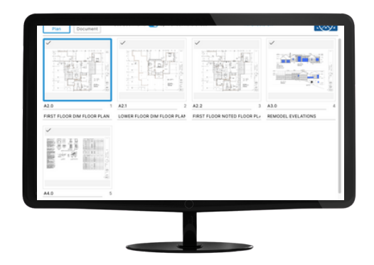
Sheet management is automatic with DigEplan, so applicants and plan reviewers do not need to split plans on in-take

DigEplan supports the management of plans at a sheet level, removing the need to force applicants to resubmit entire plan sets at each cycle, or requiring plans to be split on upload, which is complicated and cumbersome.