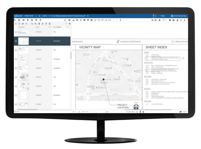
DigEplan enables users to work with electronic plan workflow review cycles directly from Accela

DigEplan for Accela provides a rich set of engineering grade annotation features that allow reviewers to communicate, comment and add in-context observations and instructions, directly within plans and supporting plan documents.